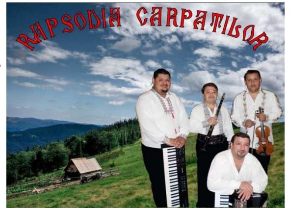
Rapsodia Carpatilor Orchestra (Chicago)

Delicious ethnic foods homemade pastries Romanian beer and wines