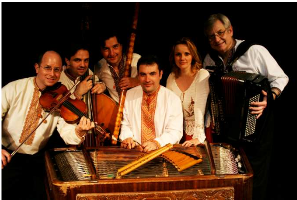
Harmonia folk band (Cleveland)

Delicious ethnic foods homemade pastries Romanian beer and wines